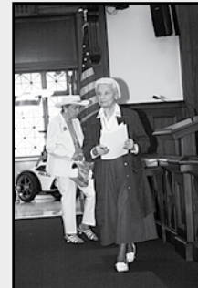
Helen walks away from her 84th City Council address.