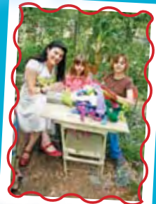
Teach the Children