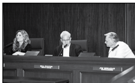
Mayor Christy Weir, and Councilmen Fulton & Monahan