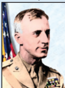
Gen. Smedley Butler

What Pinko, Commie, Socialist Fag would say that ?